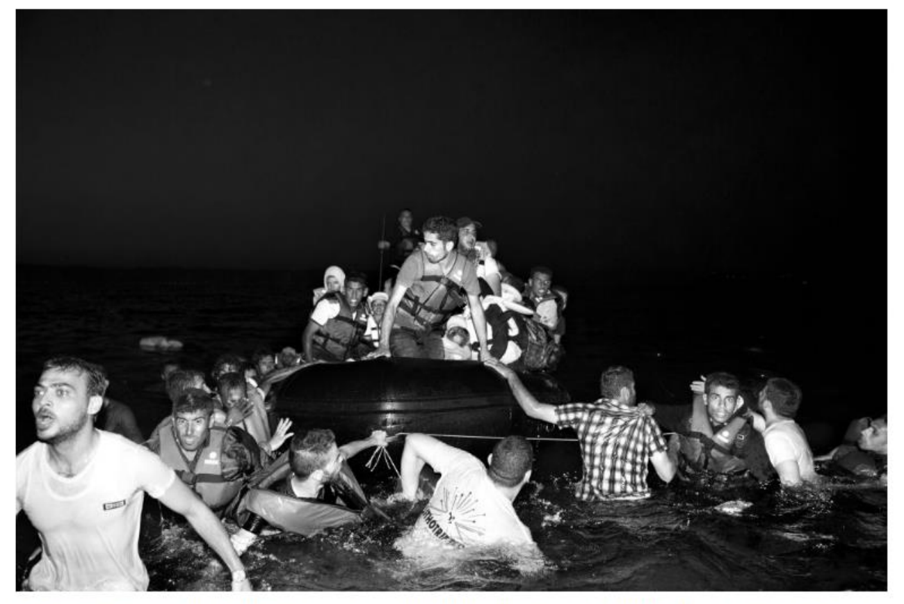
Refugees come ashore near a village on the northern tip of the Greek island of Lesbos after traveling on an inflatable raft from Turkey. Lesbos, Greece, 2015.

The exhibition, especially designed for Pistoia, consists of sixty images, some of which unpublished, displayed in the dedicated spaces in the prestigious Palazzo del Comune. The author claims to have focused on the difficulty of living together, on conflicts, on the inability of some parts of the world to find peace.